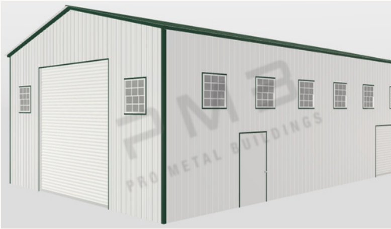
Proposed building connected to our carport

Thanks to Congresswoman Kim Schrier and Senator Maria Cantwell, we have an opportunity to expand our space to include a metal building connected to our drive-thru carport. We need to raise $142,000 for a 25% match towards the $425,100 Congressionally Designated Funding in 2024/2025 that both Congresswoman Schrier and Senator Cantwell have submitted to Congress. See attached letter from Representative Schrier to Congress Appropriations Committee.