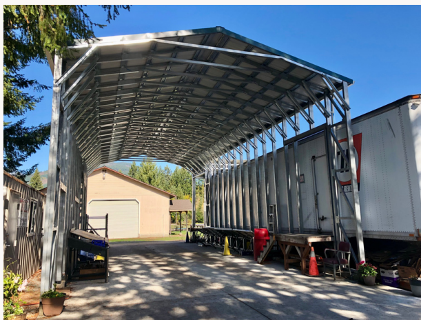
Our new drive-thru!

The Town of Darrington Council voted to lease the Darrington Food Bank adjacent property, long term, for installation of a future septic system . The design has been completed. We just need funding for the permit, a vault, pump and line to the septic field.