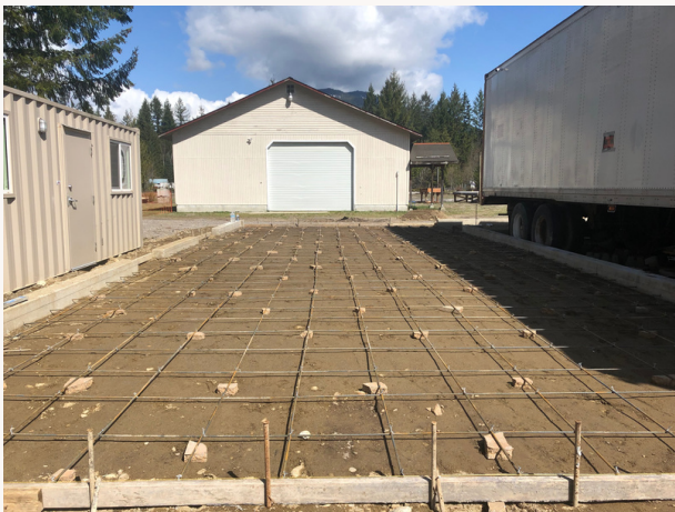
2023 Cement pour

Next year we plan to enclose the drive-through with metal panels and add roll-up garage doors at either end which will keep all of the snow and rain out as well as provide a safe place to park our box truck.