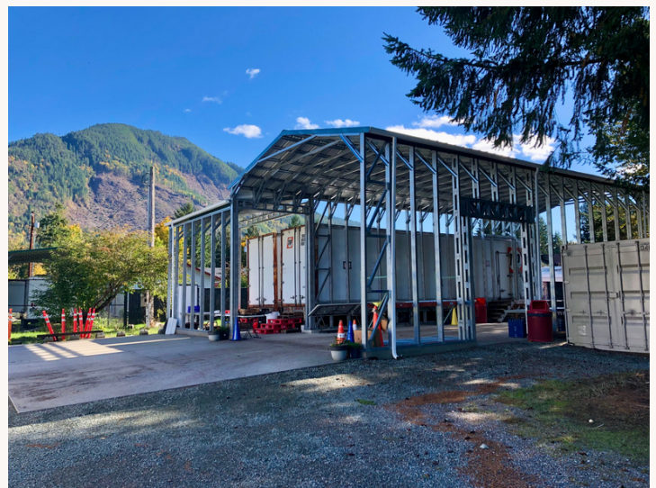
Drive-thru and Semi Trailer Cover