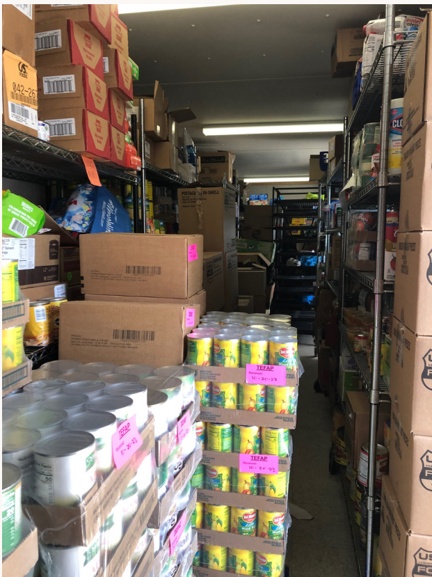
Our food supply space issue in between distribution days